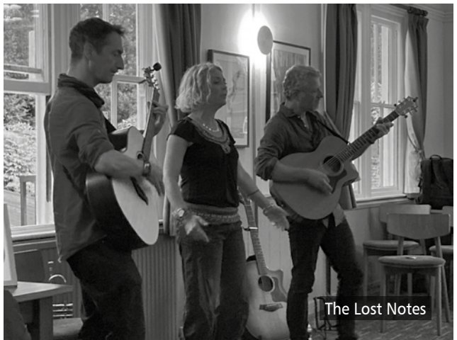
The Lost Notes